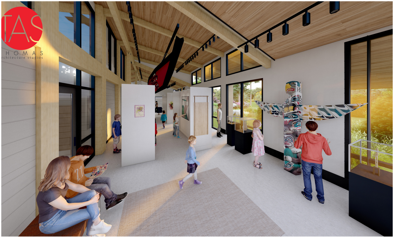
Rendering by Thomas Architecture Studios showing a cultural and historical education space in the interior of the History & Nature Center.