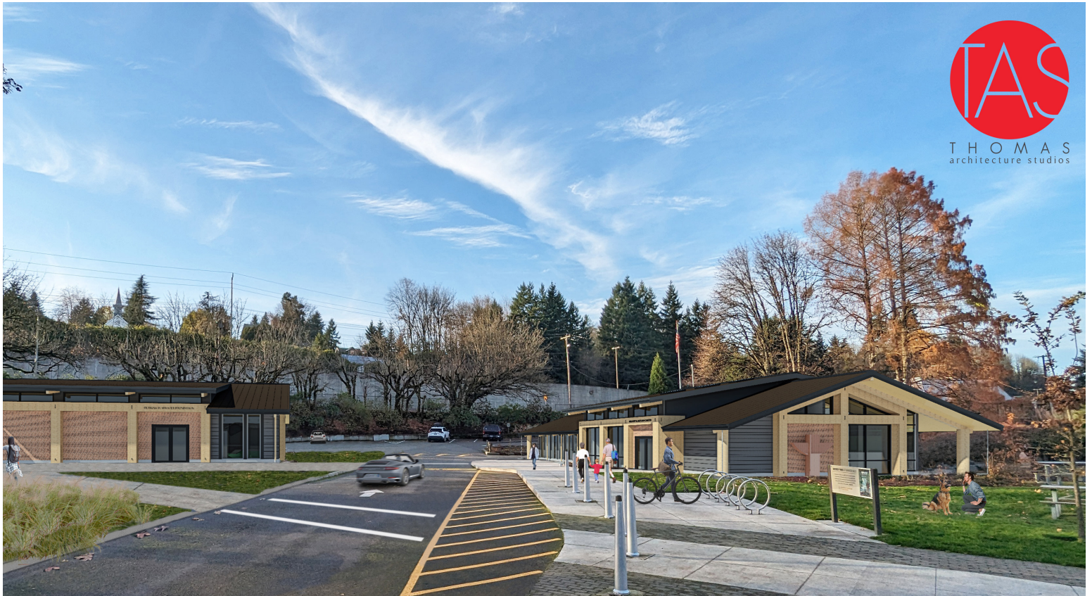
Rendering by Thomas Architecture Studios showing an exterior view of the History & Nature Center (right) and adjacent office and maintenance building (left) as seen when entering the park.